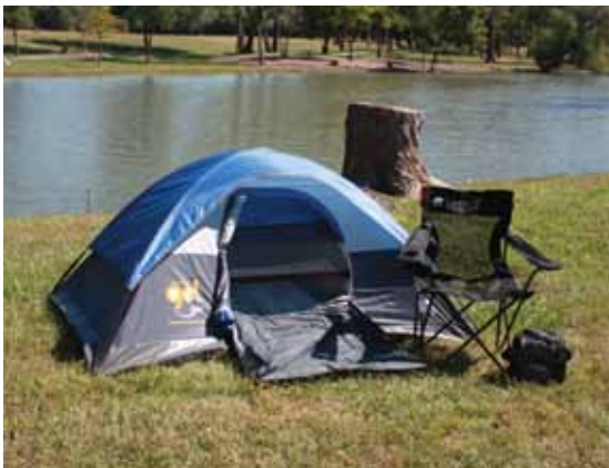
C2014-SCP Non-Imprinted Package $112.77 (E)