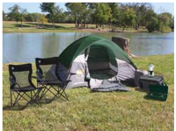
C2017-GCP Non-Imprinted Package $285.56 (E)