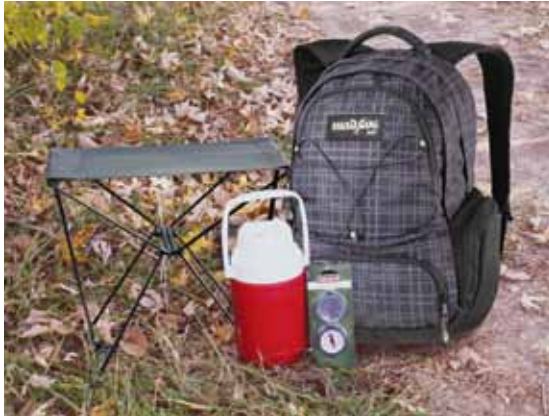
C2014-BHP Non-Imprinted Package $59.82 (E)