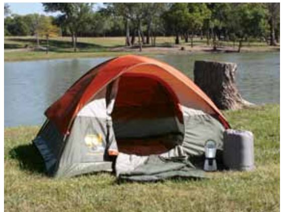
C2014-OCP Non-Imprinted Package $135.77 (E)