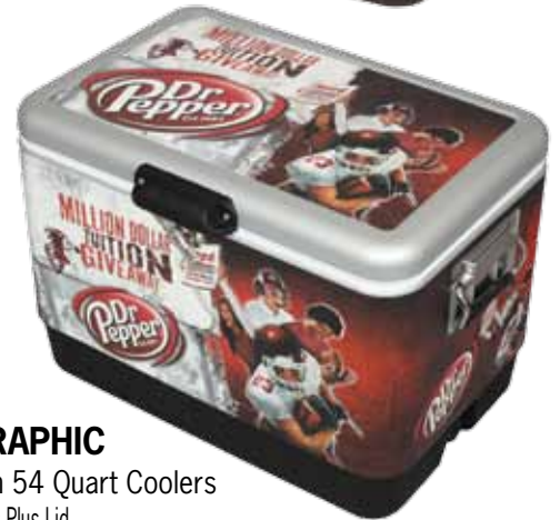
FULL GRAPHIC WRAP on 54 Quart Coolers Imprint: 4 Sides Plus Lid