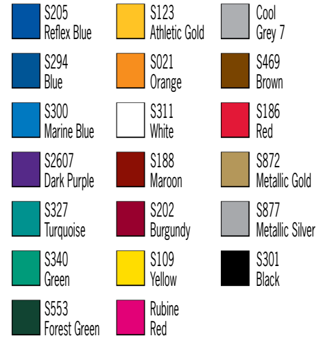
Chart shows standard colors available for imprint. When ordering, please indicate color choice by including number and name.

Printed colors on delivered products may be lighter or darker than shown here.