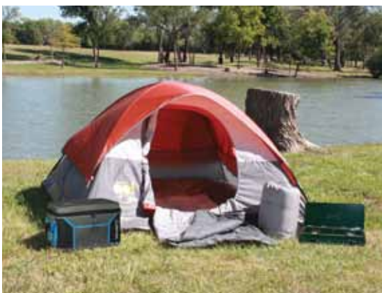
C2017-WCP Non-Imprinted Package $205.38 (E)