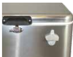
560 Optional Bottle Opener