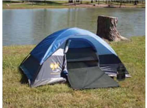
C2017-WWCP Non-Imprinted Package $75.22 (E)